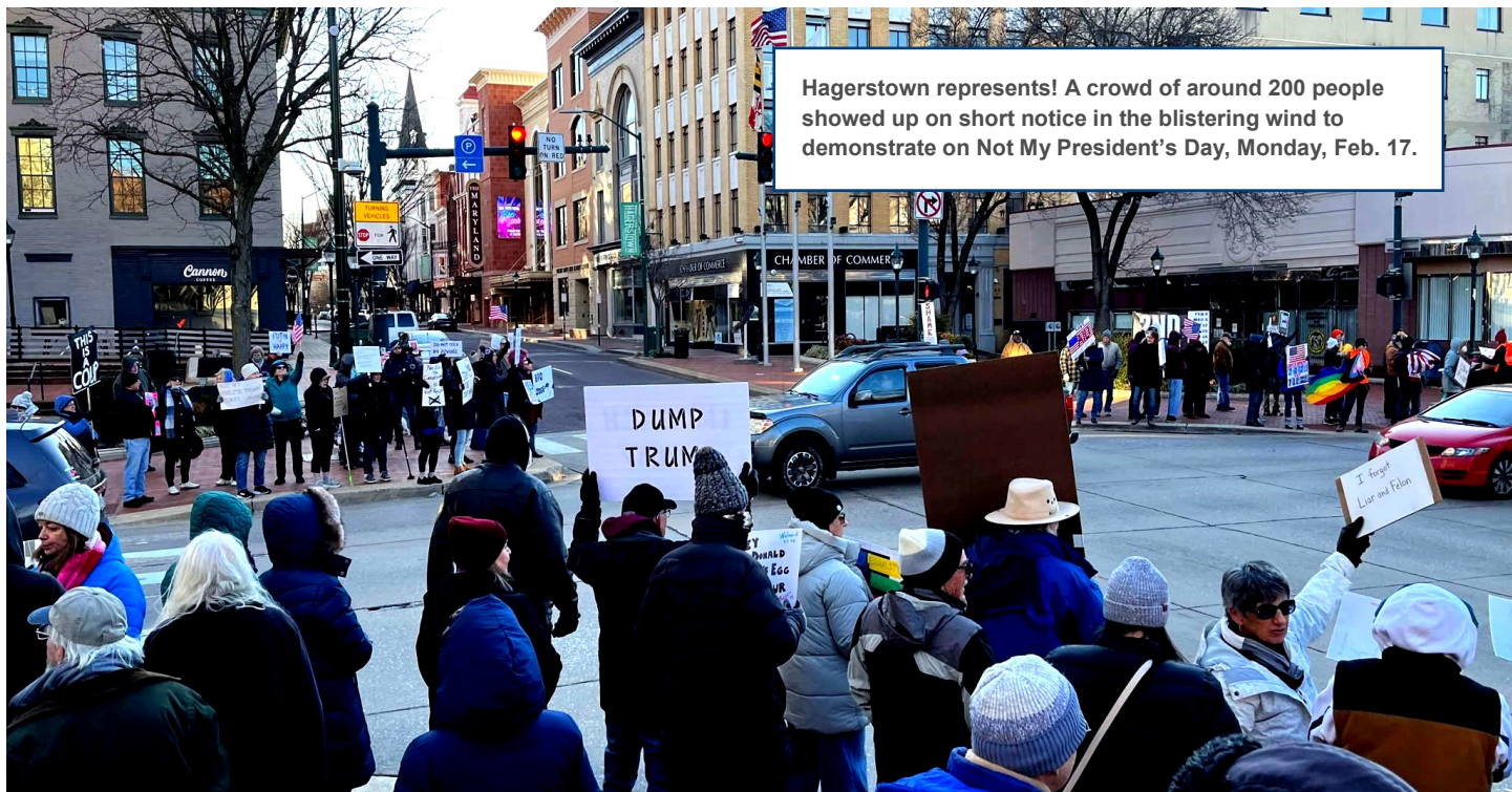
Hagerstown represents! A crowd of around 200 people showed up on short notice in the blistering wind to demonstrate on Not My President's Day, Monday, Feb. 17.